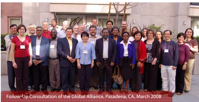
Follow-Up Consultation of the Global Alliance, Pasadena, CA, March 2008

A meeting of the GA Steering Committee is being planned for the week of March 8-11 next year in Bangalore. More information and official invitations will be sent to the steering committee and resource persons before the end of Oct 2009.