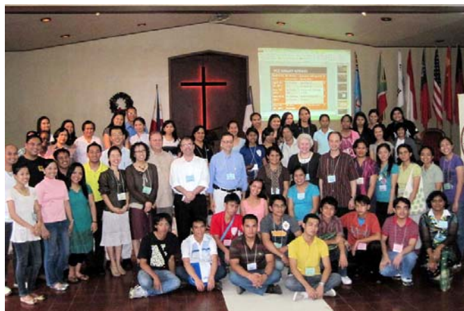
Child Theology Forum held at APNTS Wooten Chapel, Dec 4, 2010

APNTS is the graduate school for the Church of the Nazarene in the Asia-Pacific region. Based in Metro Manila, the seminary currently has 15 graduate students enrolled in its HCD program, with 10 in the PhD program and 5 in the Master program. ■