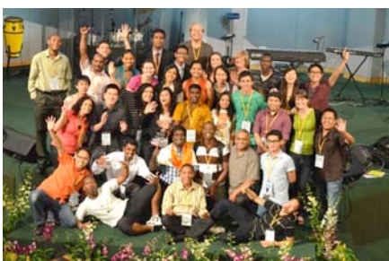
Gen Y Track participants at the third 4/14 Window Global Summit in Singapore.

At the HCD Global Alliance , we seek to bring together seminaries, theological institutions, organizations and ministry influencers to advance the cause of children through Holistic Child Development (HCD) programming. Join us today and be part of a bigger picture as together we seek to be a global advocate for children! To sign up, write to info@hcd-alliance.org .