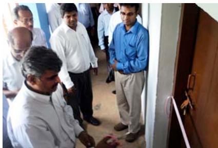
Opening of the computer lab at the launch

ON June 23, 2011, New India Bible Seminary (NIBS) in Thiruvalla, Kerala inaugurated the Master of Theology in Practical