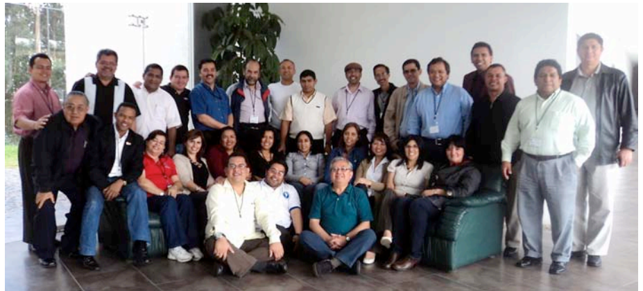
Reunion de la Alianza Regional de Programas Academicos en DINA, Quito Septiembre 2011

Los programas DINA proponen los siguientes principios generales: espiritualidad integral; hermenéutica bíblica y pastoral; teología contextual; la integralidad del ser y el desarrollo humano; y la misión, la iglesia y la sociedad.