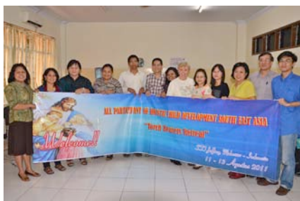
HCD Torchbearers at the Makassar retreat

THE first ever SE Asia HCD Torchbearers' Retreat was held in Makassar, Indonesia from August 11-13, 2011. Themed "Broadening the Vision," the retreat brought together 17 seminarians and children ministry leaders to encourage and learn from