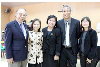
Hosts and facilitators at the training

FROM September 21-24, 2011, the HCD-focused Training of Trainers (ToT) program was held in China for a group of 27 children ministry leaders from different parts of the country. The first module of the program commenced on