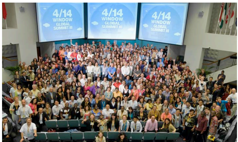
Participants at the third 4/14 Window Global Summit in Singapore, September 6-9, 2011