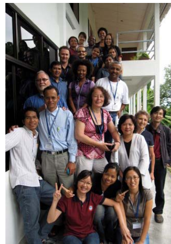
MA in HCD students with faculty and staff at the Malaysia Baptist Theological Seminary, June 2010